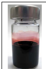
Au 200-30 8,0 wt% Suspension