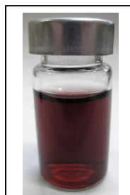
Au 200-30 0,1 wt% Suspension